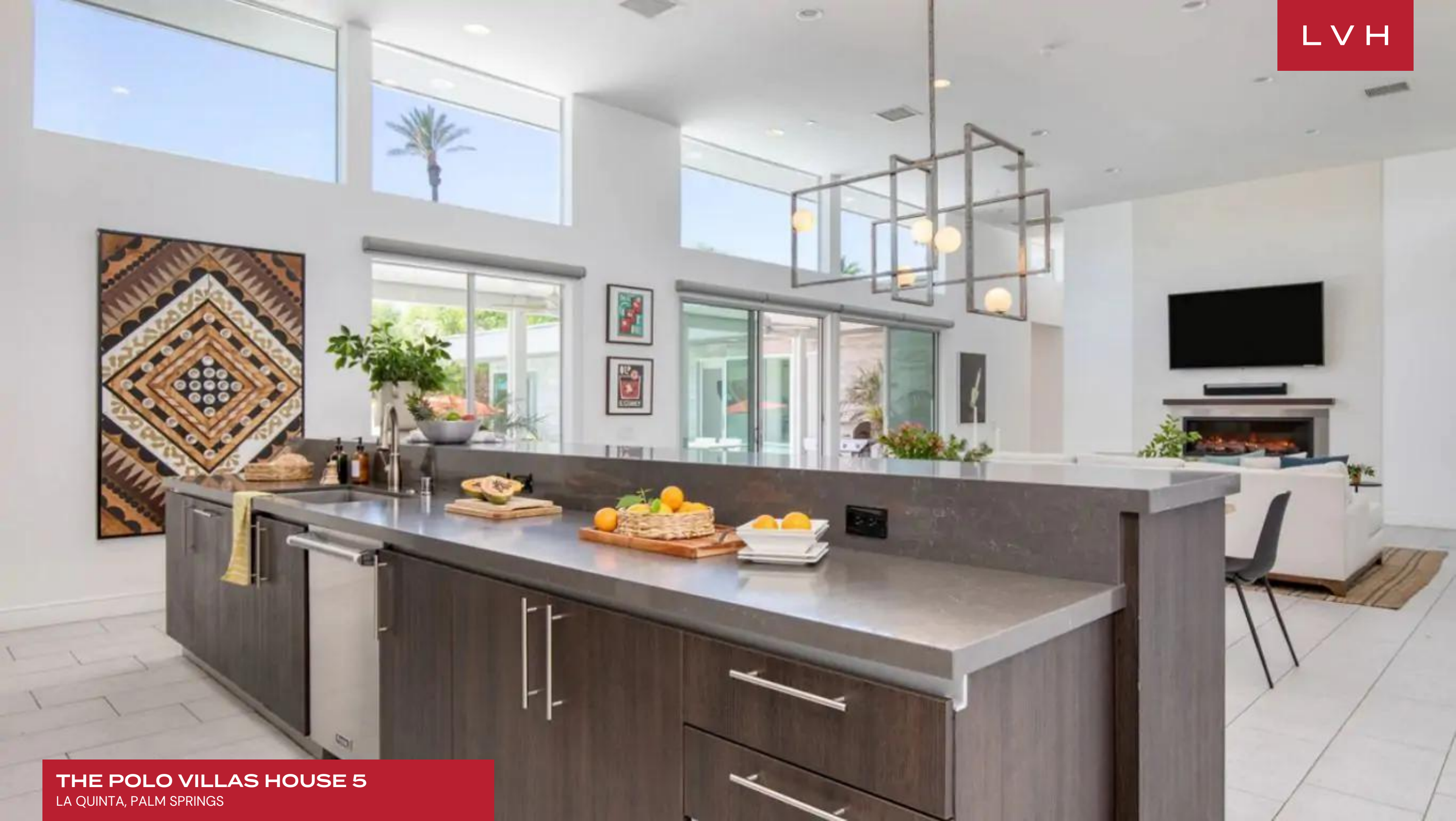
THE POLO VILLAS HOUSE 5 LA QUINTA, PALM SPRINGS