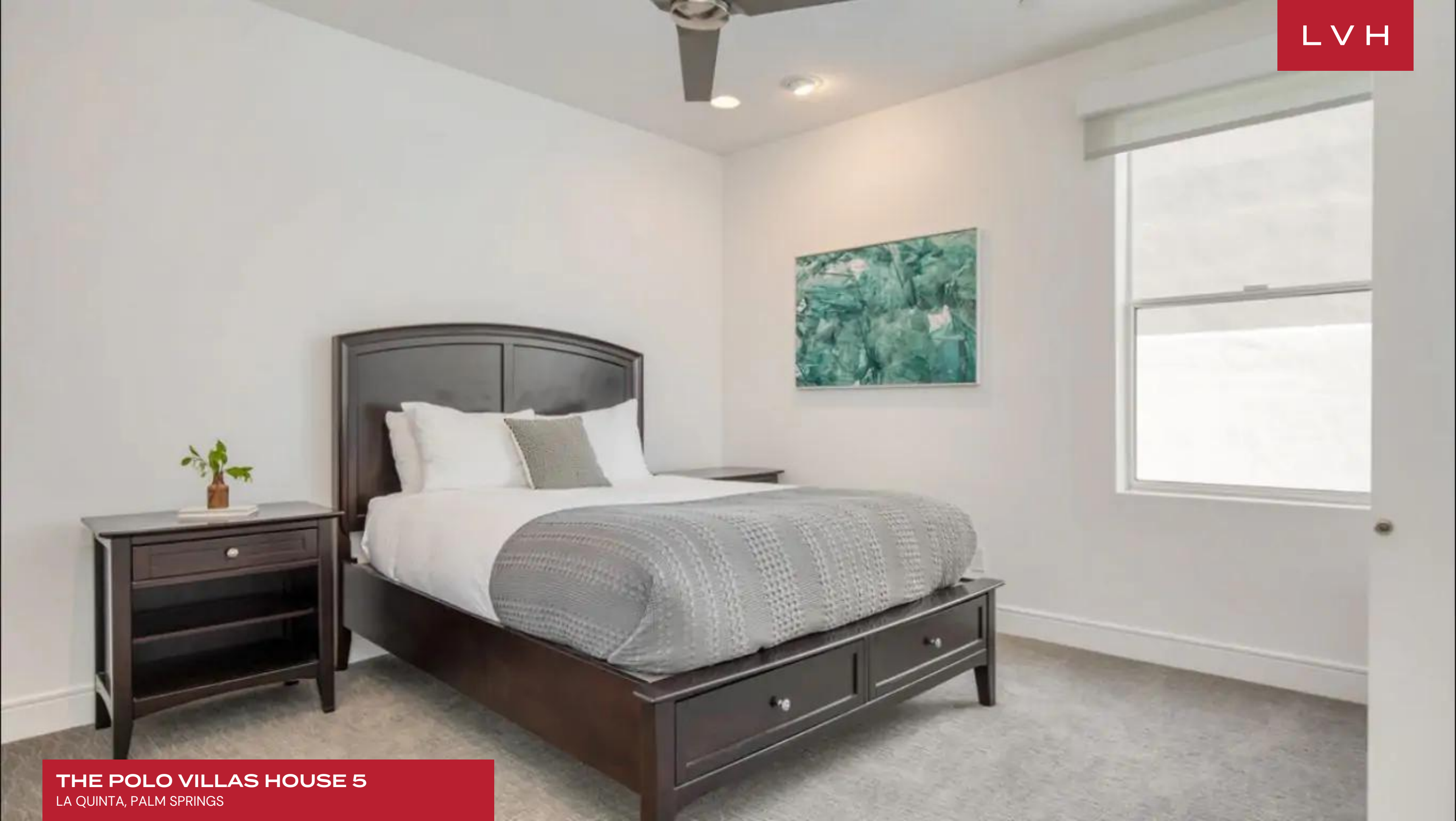
THE POLO VILLAS HOUSE 5 LA QUINTA, PALM SPRINGS