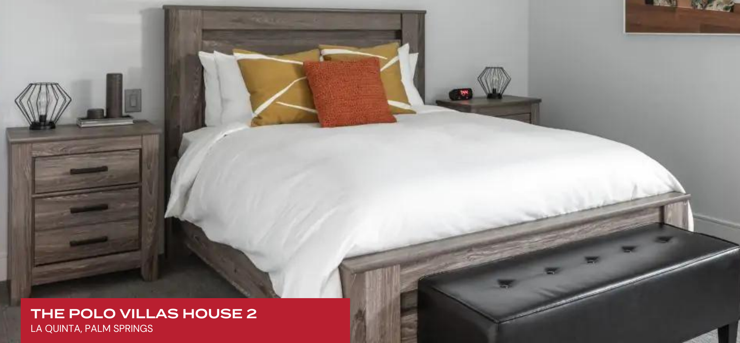
THE POLO VILLAS HOUSE 2 LA QUINTA, PALM SPRINGS